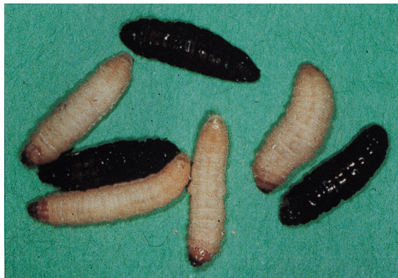
FIG. 1. G. mellonella 60 h after infection with a mean of one PA14 bacterium. Dead larvae show increased melanization.

Previous work in our laboratory resulted in a collection of more than 30 mutants of PA14 with reduced virulence in plant or nematode model systems (15, 17, 18, 22, 23; P. S. Yorgey, L. Rahme, M. W. Tan, and F. M. Ausubel, unpublished data). Whereas some of these mutations affect known bacterial viru-